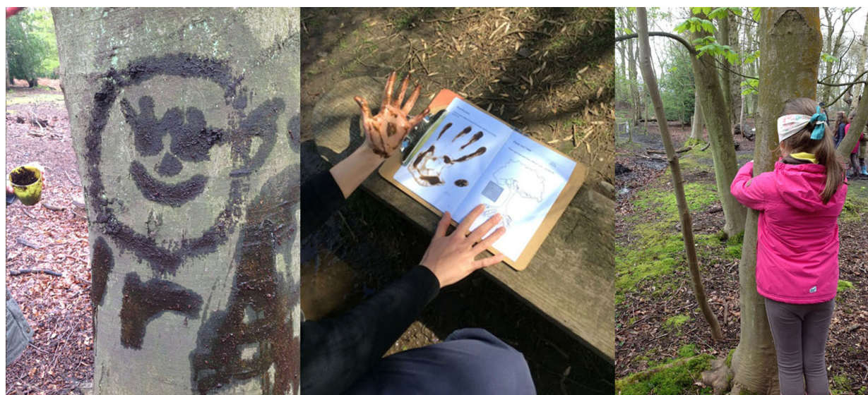
FIGURE 1. Some of the day's activities included soil painting on Epping trees for Mud Mayhem; marking the end of the session with a spectacular muddy handprint in their booklets; and meeting a tree blindfolded as part of a sensory adventure.

Mud was the key theme throughout the day and soil painting was the main activity in Mud Mayhem. This session ended with a spectacular muddy handprint in their booklets! Sensory Adventure consisted of creating a nature's palette of all the colours of the Forest and meeting a tree whilst blindfolded. Trees were recognized by leaves and bark, while minibeasts were identified in the pond and under logs based on their characteristics. Finally the girls got the chance to create a 'Mouse House' from natural materials to see if they could keep their mouse (bottle of warm water – with ears!) insulated.