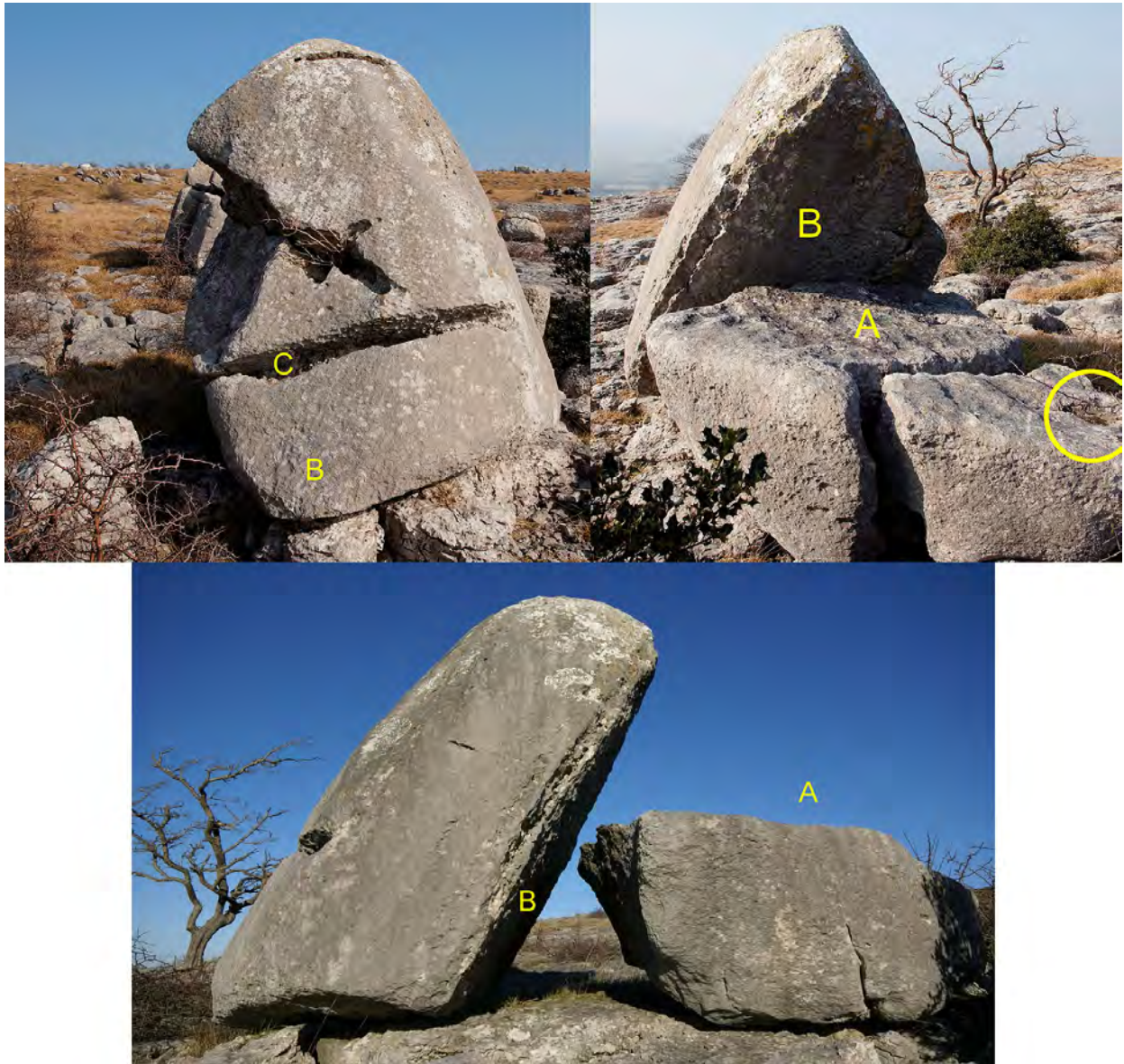
FIGURE 9. Easter Island boulder –new kamenitzas ringed yellow.