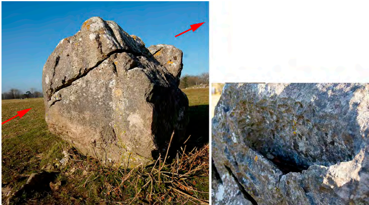
FIGURE 4. Boulder B with eccentric kamenitza. The red lines show the likely original orientation of this boulder as evidenced by an eccentrically positioned kamenitza on the west side.