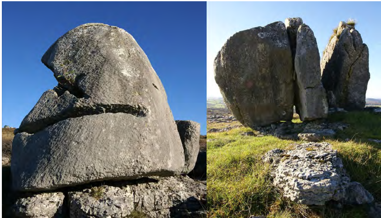
FIGURE 2. Some eccentrically orientated limestone erratic boulders at Holme Park.

derived by Wilson et al. (2012) from cosmogenic dating at Moughton Scar. Both authors emphasise that dissolution is not the only cause of pedestal erosion and that concurrent mechanical erosion principally from freeze-thaw is important too and Wilson prefers absolute surface lowering since deglaciation which in his study was 22-45 cm over 17.9 ka, the latter figure reliant on cosmogenic emplacement dates for the Norber erratics.