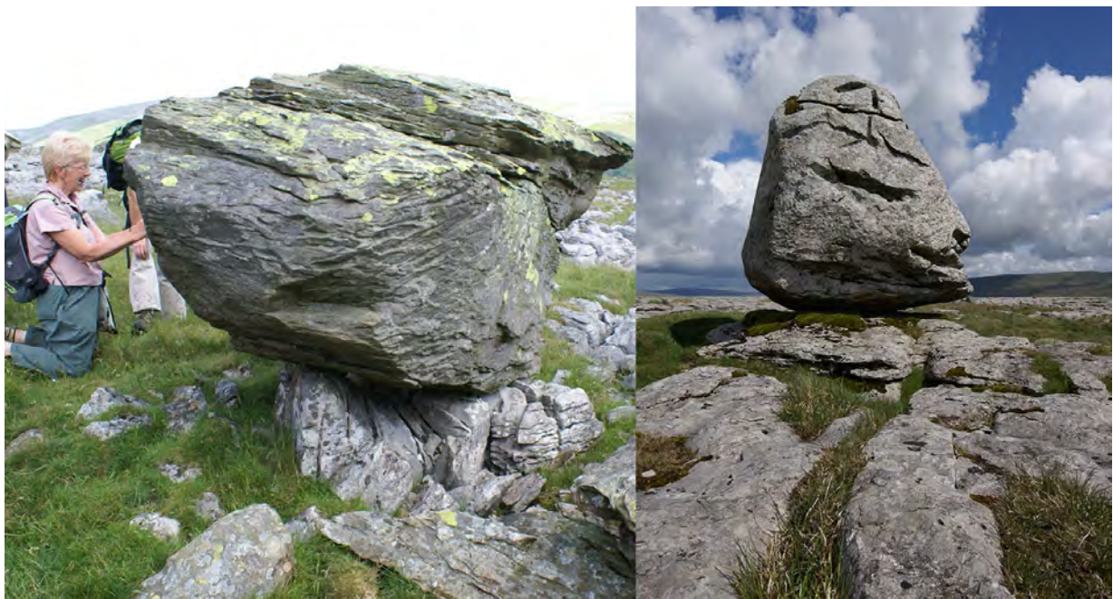
FIGURE 1. Silurian erratic at Norber Scar (left) and limestone erratic at Scales Moor (right).

The term “erratic” is usually applied to glacially transported boulders whose lithologies differ from the bedrock of their depositional site. Thus, at Norber Scar, Silurian Greywackes rest upon Carboniferous Limestone (Fig. 1, left). However, ice can quarry rocks of one lithology and move them to new locations that are still part of the same outcrop such as the limestone boulders on Scales Moor.