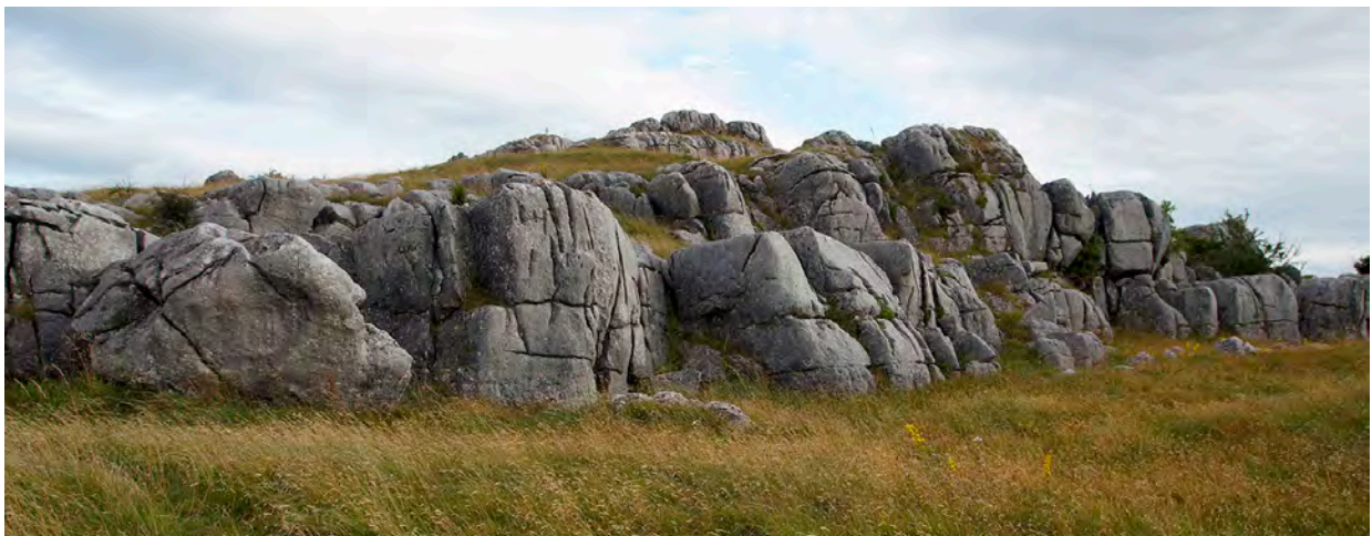
FIGURE 10. Likely source for the Holme Park erratic boulders.