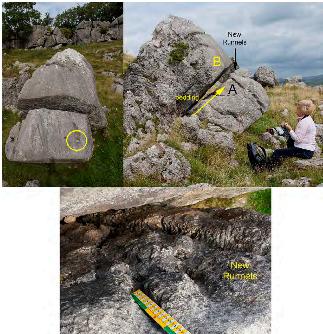
FIGURE 8. Pyramidal Boulder – yellow ring marks new kamenitza, 11 cm wide, 5 cm deep.

Example 2. The pyramidal boulder at SD55097939 may be glacial or the result of mass movement from the cambered limestone scar 100 m away but the principles of erosion in its new position are similar. The boulder (Fig. 8) has fractured along the bedding with new runnels 7 cm wide and 5 cm deep on the lower slab (A) but no erosion on the sheltered upper slab surface (B).