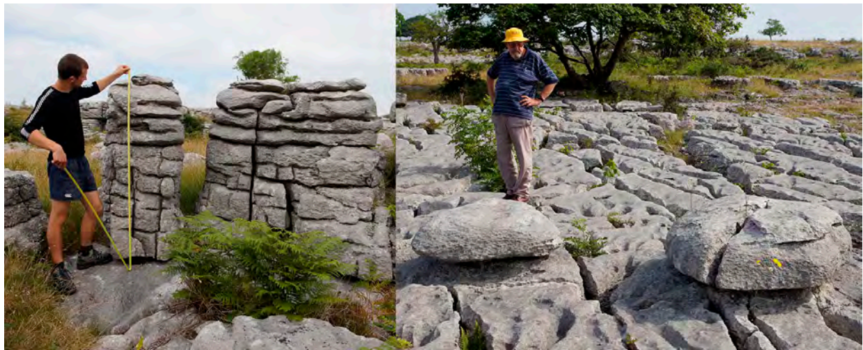
FIGURE 6. Type 1 boulder isolated from a maturely weathered outcrop (left); Type 2 with pedestals (right).