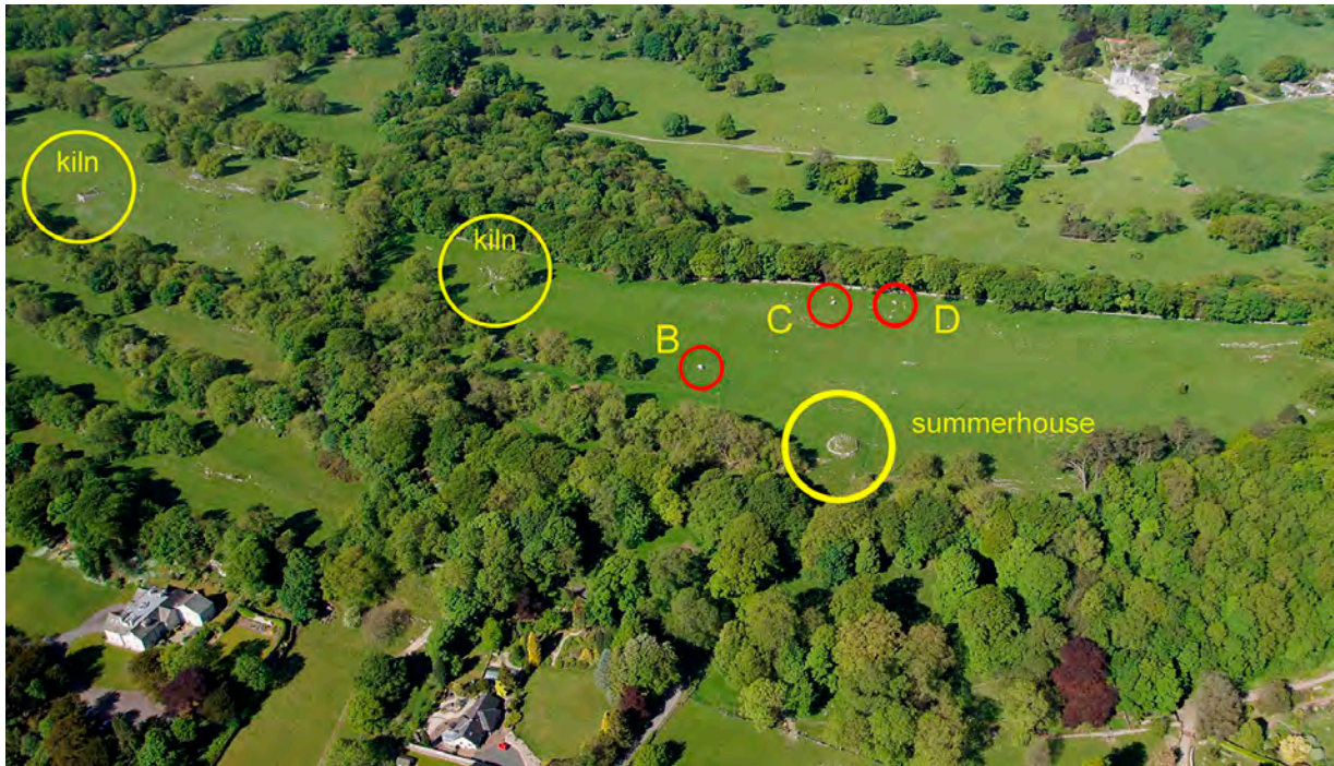
FIGURE 3. Aerial view of Summerhouse Hill, plinth remnants and boulders B-D (Boulder A is hidden from view).

The largest boulders at Summerhouse Hill have volumes up to 12 m 3 with weights up to 28 t. Devensian ice could easily have transported such boulders which probably came from local limestone scars 200-1000 m north.