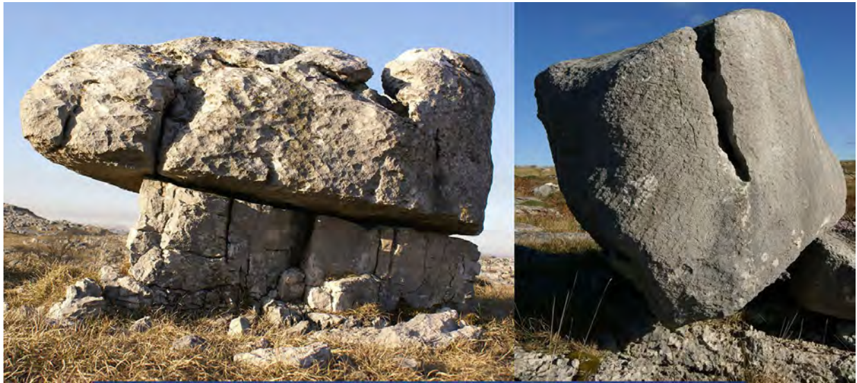
FIGURE 5. Examples of Holme Park's erratic limestone boulders.

Type 4. There are numerous other boulders where the original orientation is difficult to establish.